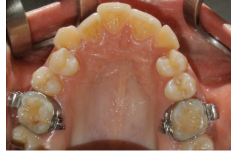
FIGURE 1: Presurgery clinical occlusal view. For orthodontic motive, this patient needed the bilateral extraction of the upper first premolars.

2.2. Surgical Procedure. An alveolar nerve block infiltration was administered with local or regional anesthesia, depending on the dental arch, using 2% mepivacaine. Mepivacaine does not contain epinephrine, so it was used to prevent restriction of the blood supply. To prevent interference with the healing process, no intraligamentous or intrapapillary infiltration was made. The teeth were extracted in a nontraumatic manner without elevation of full-thickness flaps and preserving the buccal and lingual walls of the alveolar sockets in order to minimize the possible trauma