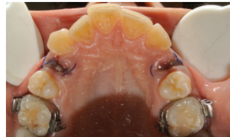
FIGURE 4: Clinical occlusal view 3 days after surgery. In the study site, the epithelialization process was more advanced than in the control site. In the study site, the inflammatory reaction was reduced.

L-PRF = study site; CTRL = control site.