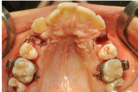
FIGURE 3: The upper right socket (study site) was filled with L-PRF, while the upper left socket (control site) had to follow natural healing. Both sites were sutured.

cells (red thrombus), obtaining a fibrin clot with a red small portion in order to include the “buffy” coat richer in large leucocytes [24]. The L-PRF clot was condensed and modeled on a sterile surgical plate before the application in the sockets [24].