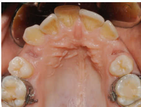
FIGURE 6: Clinical follow-up at 14 days after surgery. Both postextraction sockets were completely closed with the soft tissues.

harvest) and platelets embedded in a fibrin matrix [30, 31]. The fibrin architecture of L-PRF, constituted by connected trimolecular junctions (or equatorial), due to a slow polymerization of the platelet concentrate and due to the absence of heterologous thrombin, induces a flexible fibrin network, able to promote the gradual release of growth factors and leukocytes migration. The fibrin membrane promotes the mechanical protection of the surgical site and, biologically, it interacts with the physiological mechanisms of healing favoring the angiogenesis [13, 14]. The fibrin induces the expression of \alpha v\text{-}\beta 3 integrin by endothelial cells, allowing the links with structural proteins, such as fibronectin and vitronectin, supporting the process of formation of capillaries [12]. In relation to the previous properties, the fibrin also allows the association of some growth factors, such as FGFb (fibroblast growth factor basic) and PDGF (platelet-derived growth factor) involved in the angiogenic process and useful as chemotactic factors, favoring diapedesis of white blood cells [12]. The immunological properties of the L-PRF, resulting from its content in leukocytes, could be useful to prevent the surgical site infections, such as postextraction alveolitis, with a consequent reduction of the inflammation symptoms. The presence of leukocytes is a very important parameter to stimulate healing and wound control [32].