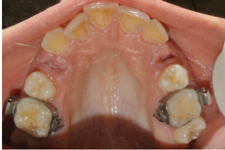
FIGURE 5: Clinical occlusal views 7 days after surgery. The sutures were removed. Both postextraction socket cavities presented a decreased volume and appeared epithelialized.