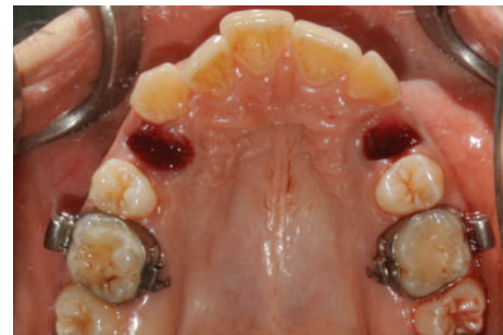
FIGURE 2: The postextraction sockets.

and to give adequate support to the L-PRF filling (Figures 1 and 2). All extraction sites were simple with alveolar walls preserved. All alveolar sockets were sutured with a 3/0 Vicryl (Ethicon/Johnson & Johnson, Somerville, NJ, USA). Each patient also served as the control (split-mouth design): a socket was treated with L-PRF application (study socket) whereas the other (control socket) had to undergo natural healing by clot formation without socket filling (Figure 3). The number of paired extractions per patient ranged from 2 to 4 for a total of 108 extractions. Indication for tooth extraction included root or crown fractures, residual roots, no restorable caries, periapical granuloma, and orthodontic reasons. Patients showing anatomic and pathologic conditions not comparable between the study and control sites were excluded as study subject. Antibiotic prophylaxis was undertaken (amoxicillin 875 mg and clavulanic acid 125 mg) starting 2 days before surgery up to 3 days after it.